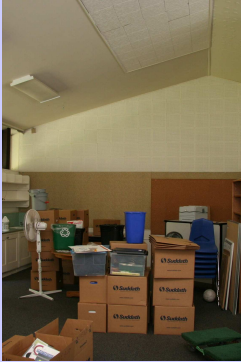
Room 17: ready for its REFURBISHMENT!